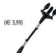
AC0-0904 Standard CB Mic Lanyard (Fits RT2/RT4 Series)