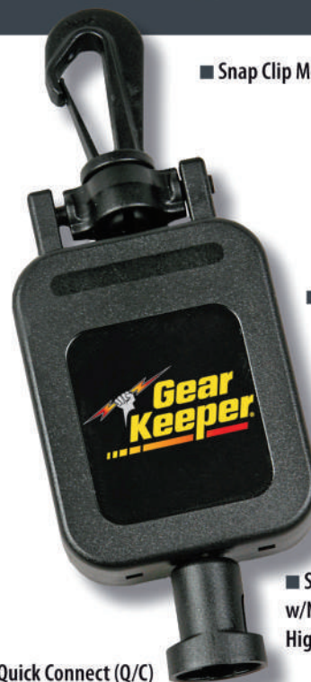
■ Snap Clip Mount

Both models come with a convenient D-ring for mounting the Gear Keeper to any existing screw (i.e. headliner, visor, radio mount or dome light). Additionally, the lanyard attachment drops the Mic to a convenient hanging position.