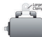
Large Clamp (Semi Permanent)