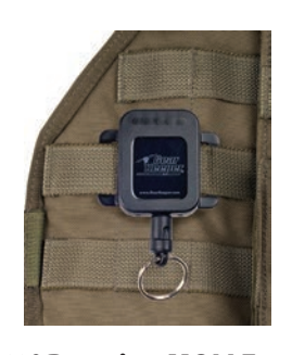
360° Rotating MOLLE Mount Minimizes gear movement Rotation Minimizes resistance & maximizes