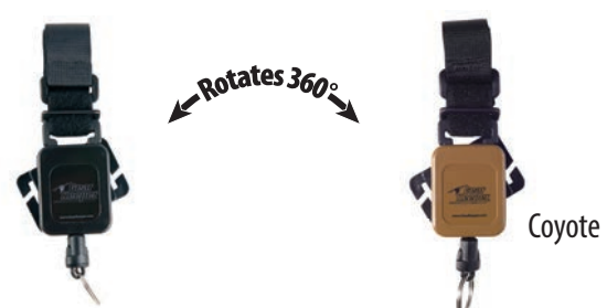
■ Combo MOLLE Mount (€ 25.99) RT4-5170 Force: 85 gr (3 oz.) Extension: 91 cm (36") RT4-5171 Force: 170 gr (6 oz.) Extension: 91 cm (36") RT4-5174 Force: 255 gr (9 oz.) Extension: 81 cm (32")